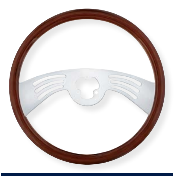
2-SPOKE STEERING WHEELHub and horn assembly available separately88239