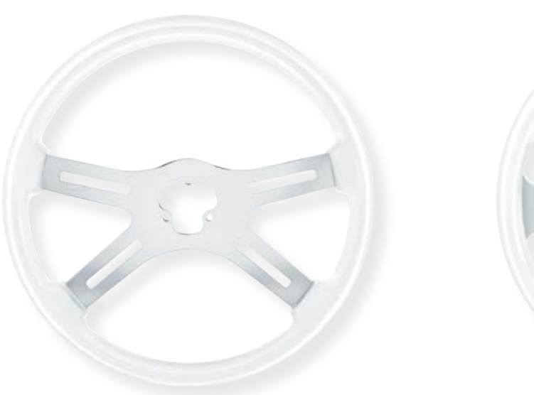
GLACIER WHITE 4-SPOKE STEERING WHEEL • High gloss white finish 88263