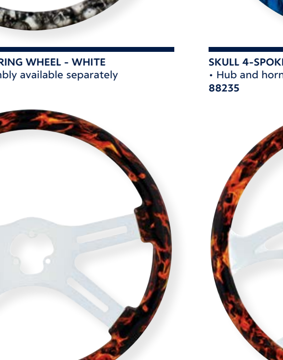
FLAME 4-SPOKE STEERING WHEEL • Hub and horn assembly available separately 88248

SKULL 4-SPOKE STEERING WHEEL - WHITE • Hub and horn assembly available separately 88234