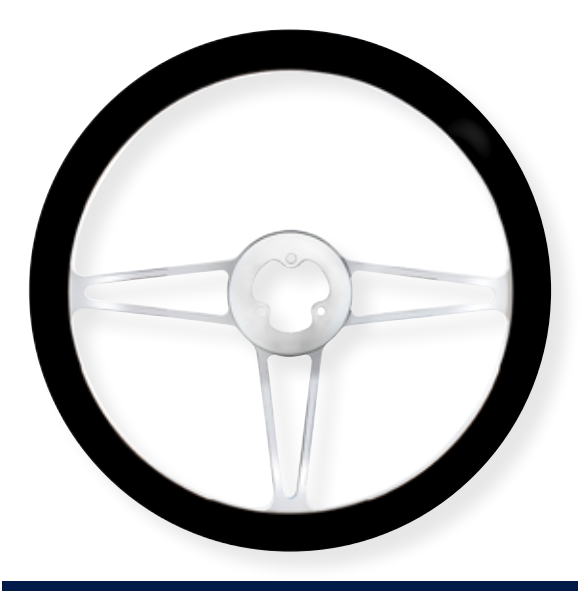
3-SPOKE STEERING WHEELHub and horn assembly available separately88172