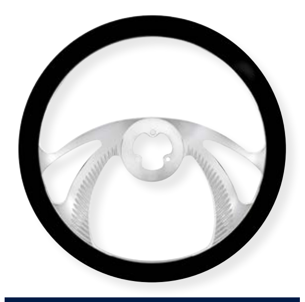
SCORPION STEERING WHEEL • Hub and horn assembly available separately 88159