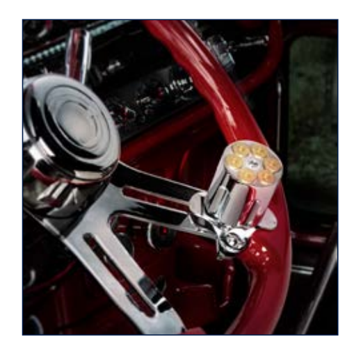
GUN CYLINDER STEERING WHEEL SPINNER