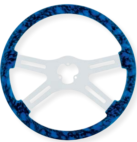
SKULL 4-SPOKE STEERING WHEEL - BLUE • Hub and horn assembly available separately