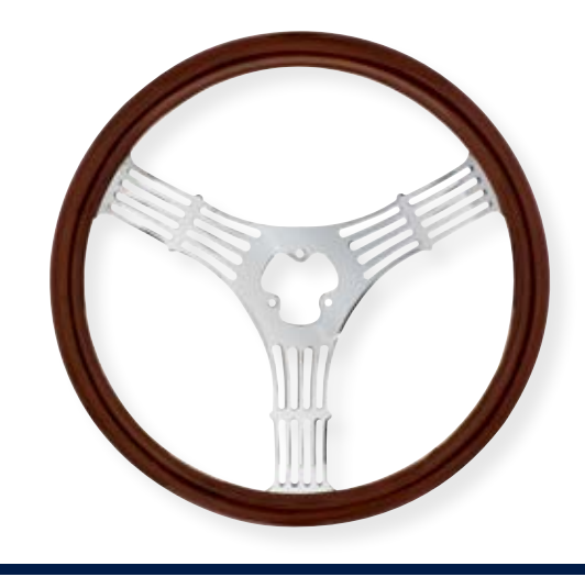
BANJO STEERING WHEEL • Hub and horn assembly available separately 88106