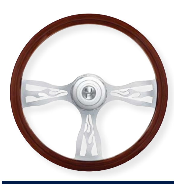
FLAME STEERING WHEEL