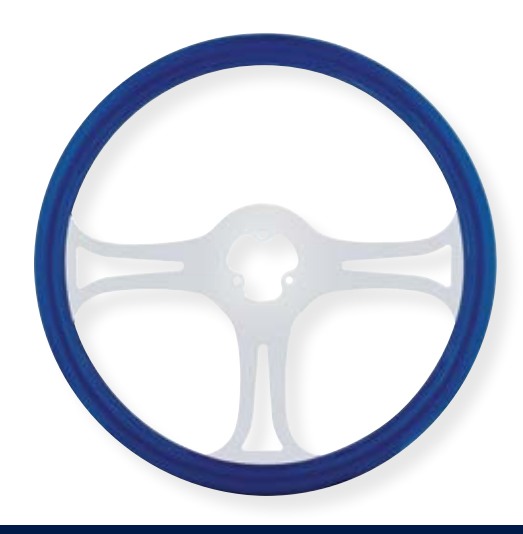
BLUE BLADE STEERING WHEEL • Hub and horn assembly available separately 88246