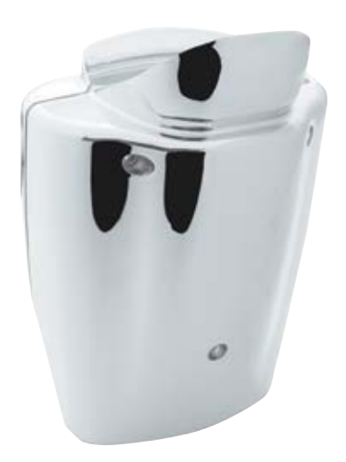
KENWORTH MID STEERING COLUMN COVER • Fits 2006+ Kenworth 41367