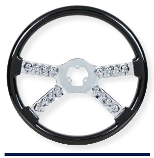
BLACK WOOD RIM/CHROME SPOKE STEERING WHEEL Hub and horn assembly available separately 88177

RED WOOD RIM/CHROME SPOKE STEERING WHEEL Hub and horn assembly available separately 88176