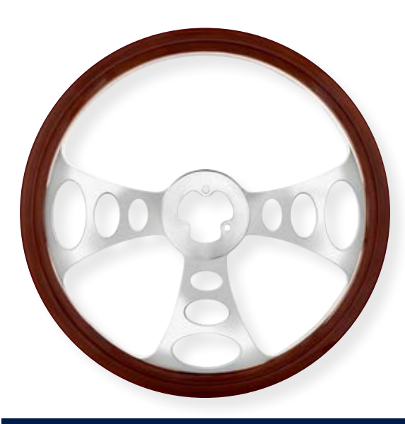
CHOPPER STEERING WHEEL • Hub and horn assembly available separately 88169