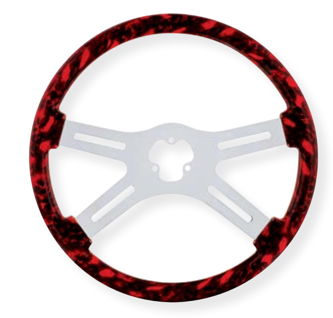
SKULL 4-SPOKE STEERING WHEEL - RED • Hub and horn assembly available separately 88236