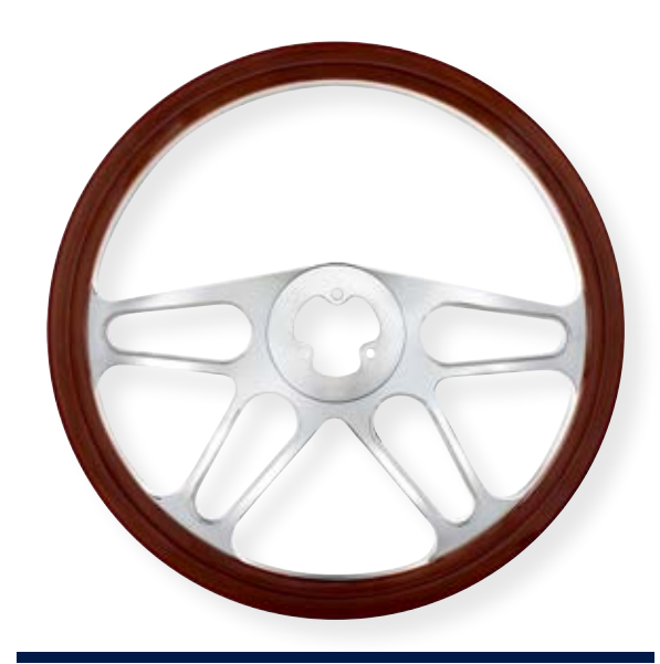
4-SPOKE STEERING WHEELHub and horn assembly available separately88166