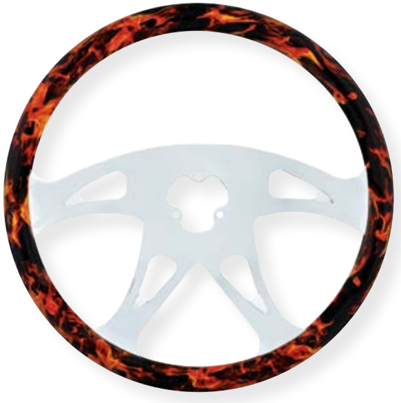
FLAME BOSS STEERING WHEEL • Hub and horn assembly available separately 88249