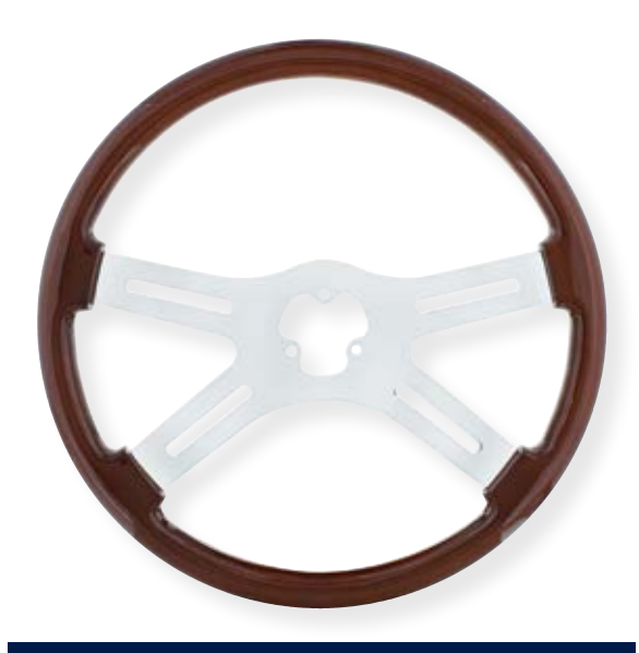
4-SPOKE STEERING WHEEL 88217

SCORPION STEERING WHEEL • Hub and horn assembly available separately 88107