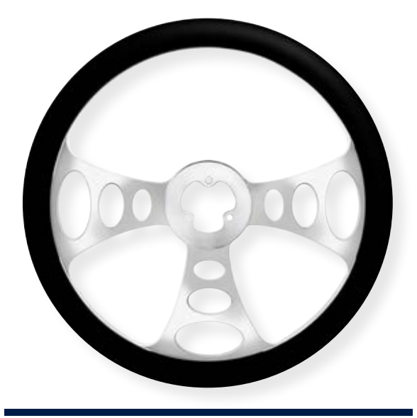
CHOPPER STEERING WHEEL • Hub and horn assembly available separately 88161