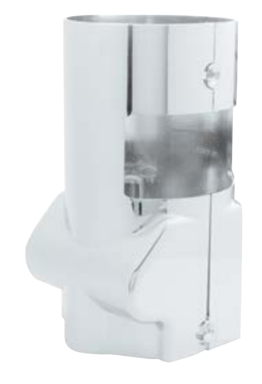
INTERNATIONAL MID STEERING COLUMN COVER • Fits various years and models 40934

PETERBILT LOWER STEERING COLUMN COVER • 2006+ Peterbilt 41241