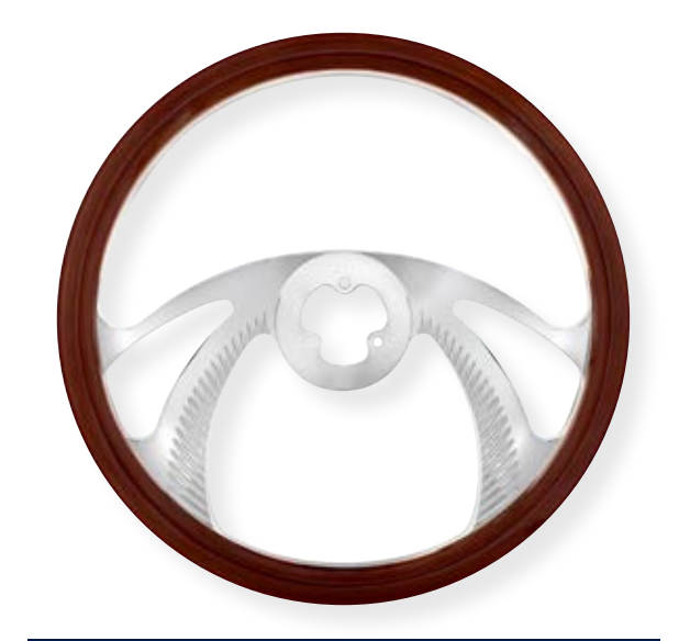
SCORPION STEERING WHEEL • Hub and horn assembly available separately 88168