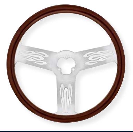
FIRESTORM STEERING WHEEL • Hub and horn assembly available separately 88105