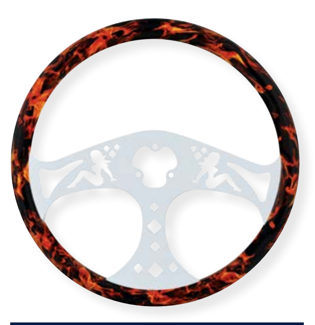
FLAME LADY STEERING WHEEL • Hub and horn assembly available separately 88250