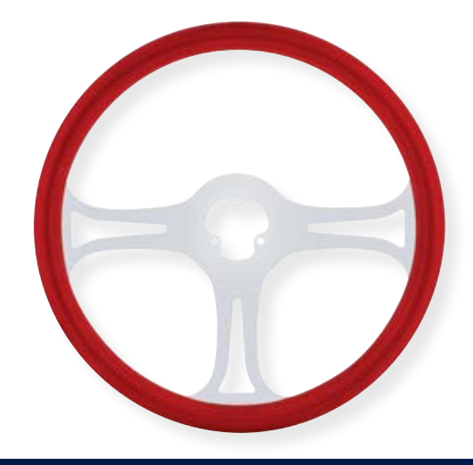
RED BLADE STEERING WHEEL • Hub and horn assembly available separately 88247