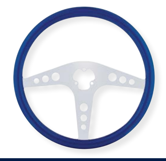
BLUE GT STEERING WHEEL • Hub and horn assembly available separately 88244