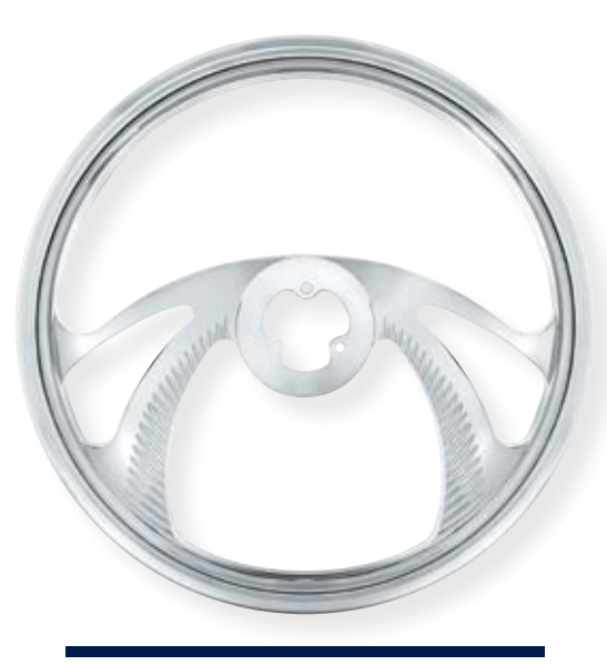
SCORPION STEERING WHEEL • Chrome aluminum 88158

4-SPOKE STEERING WHEEL• Chrome aluminum88154