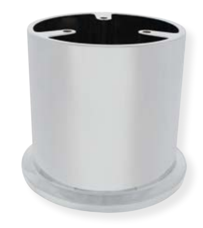
CHROME STEERING WHEEL HUB - FREIGHTLINER • Fits various 2007+ Freightliner models • Spline count: 72 88238

CHROME HUB FOR 3-BOLT STEERING WHEELS - INTL. • Fits International (except telescopic) including Navistar • Spline count: 36 88213