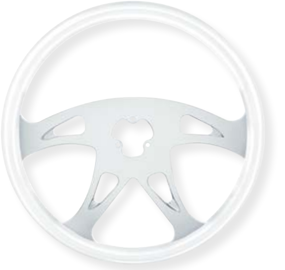
GLACIER WHITE BOSS STEERING WHEEL • High gloss white finish 88264