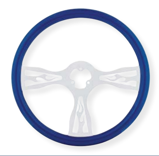
BLUE FLAME STEERING WHEEL • Hub and horn assembly available separately 88242

BLUE LADY STEERING WHEEL • Hub and horn assembly available separately 88240