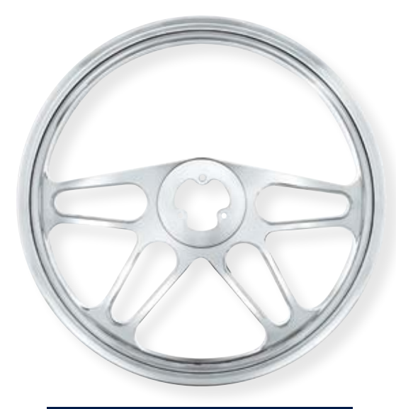
BLAZE STEERING WHEEL • Chrome aluminum 88150

4-SPOKE STEERING WHEEL• Chrome aluminum88154