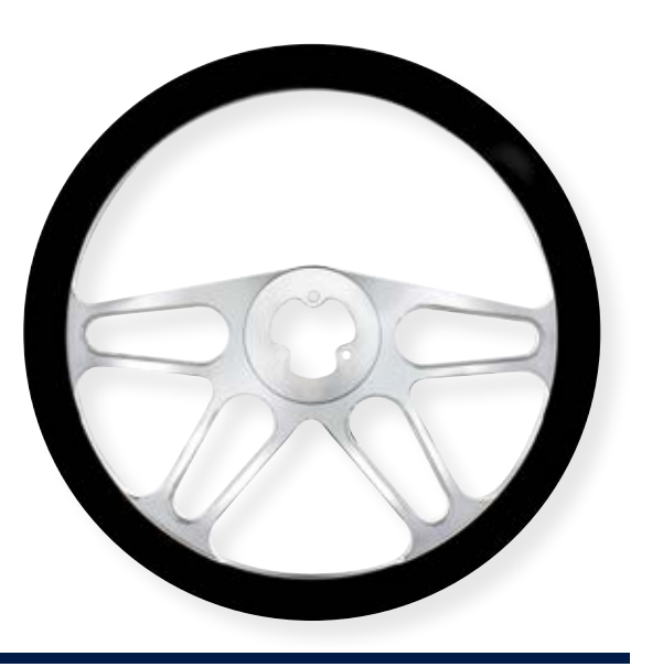
4-SPOKE STEERING WHEEL Hub and horn assembly available separately 88155

BLAZE STEERING WHEEL • Hub and horn assembly available separately 88151