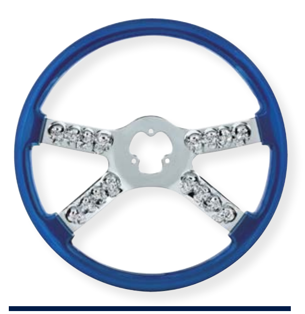
BLUE WOOD RIM/CHROME SPOKE STEERING WHEEL • Hub and horn assembly available separately 88175

WOOD RIM/CHROME SPOKE STEERING WHEEL • Hub and horn assembly available separately 88174