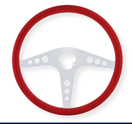
RED GT STEERING WHEEL • Hub and horn assembly available separately 88245