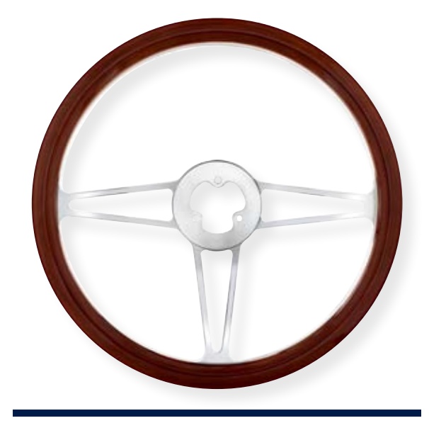
3-SPOKE STEERING WHEELHub and horn assembly available separately88173