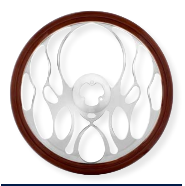
BLAZE STEERING WHEELHub and horn assembly available separately88164