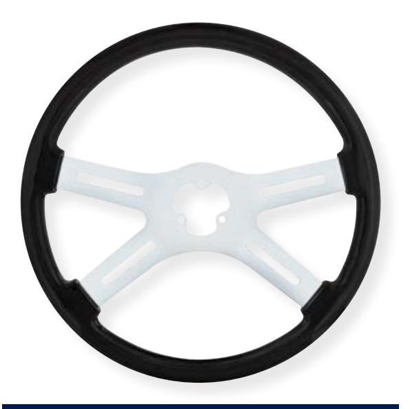
CARBON BLACK 4-SPOKE STEERING WHEEL • Deep luxurious carbon black finish 88237